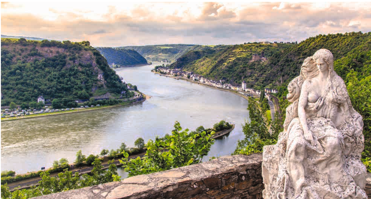
LORELEI FIGURE AND RHINE VALLEY

A wonderful morning for a leisurely breakfast, time to admire the striking beauty of the Moselle Valley, or to take advantage of your ship's many amenities. How about a massage or spa treatment, or a dip in the pool? After lunch, stop