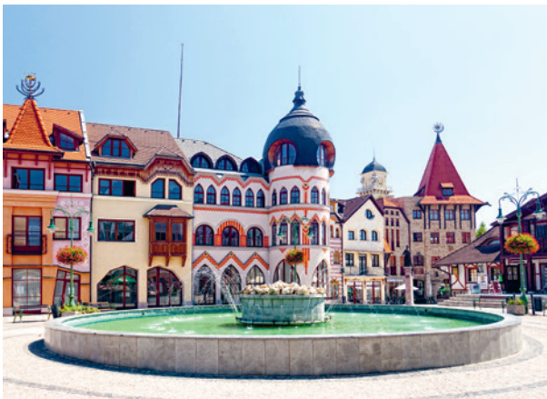
EUROPE PLACE, KOMÁROM

Awaken this morning in Esztergom, capital of Hungary from the 10th to the mid-13th centuries. Exciting RIVERSIDE CHOICE options are a visit to