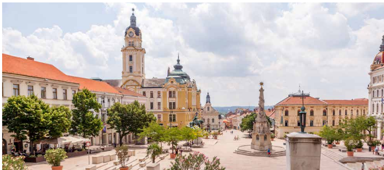
SZÉCHENYI SQUARE, PÉCS

Experience the best of the Balkans on this immersive cruise through Hungary, Serbia, Bulgaria, Romania, and Croatia. See LOWER DANUBE WITH HUNGARY & THE BALKANS IN DEPTH on the website for details.