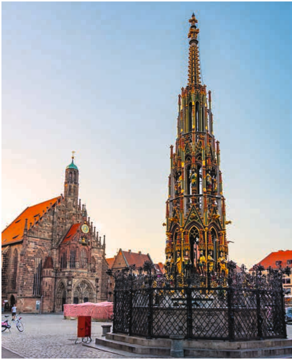
BEAUTIFUL FOUNTAIN AND CHURCH OF OUR LADY, NUREMBERG