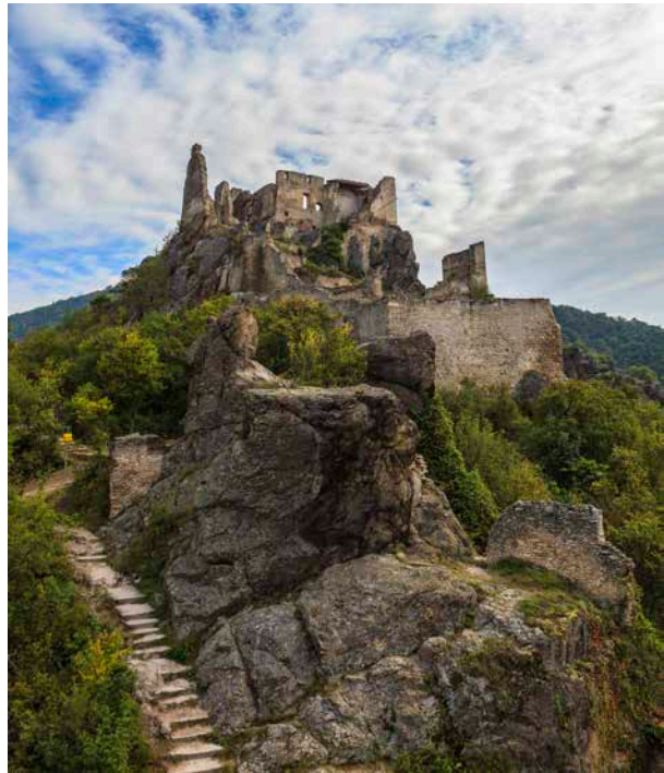
DÜRNSTEIN CASTLE RUIN