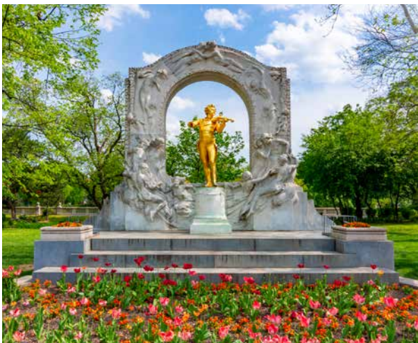
JOHANN STRAUSS MONUMENT, VIENNA

Welcome to Vienna, Austria's inimitable capital that was influenced heavily over the centuries by monarchs and musicians alike! RIVERSIDE CHOICE offers a panoramic city tour and walk through the historical district, a visit to the Habsburgs' mighty Schönbrunn Palace, and other exciting excursions. On offer this evening is a RIVERSIDE SIGNATURE after-hours entrance into stunning Belvedere Palace for a private orchestral performance and a crowd-free viewing of Klimt's masterful The Kiss.