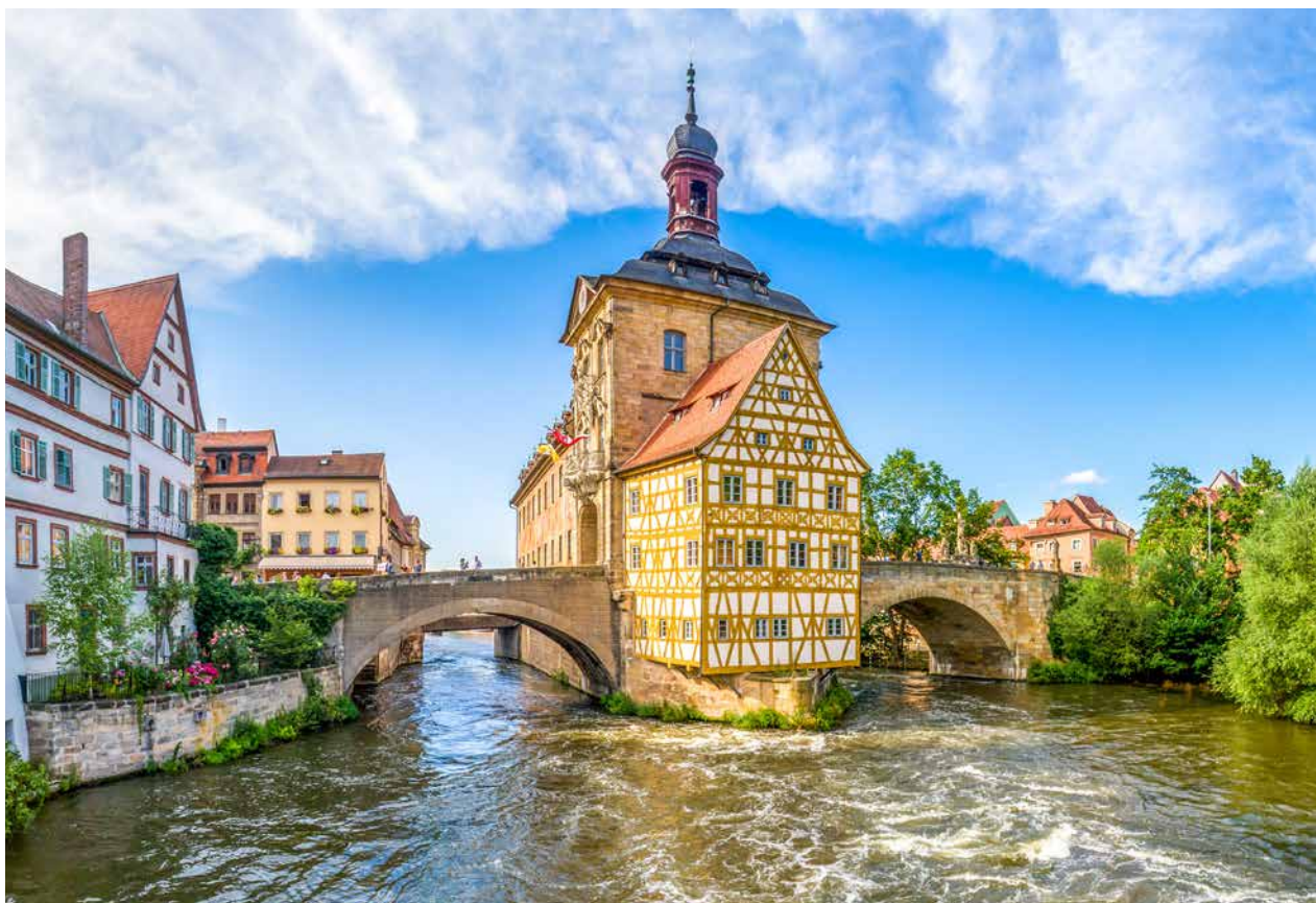
OLD TOWN HALL, BAMBERG

One of Germany's unrivaled masterpieces awaits in the UNESCO World Heritage Site of Bamberg. Dating back to the 9th century, the city extends over seven church-capped hills, leading to its nickname of Franconian Rome. A great selection of RIVERSIDE CHOICE excursions is available, including a guided visit to the four-towered cathedral founded in 1004 AD, the quaint fishermen's huts lining the canals of Little Venice, and the unusual Old Town Hall, built right in the middle of the river in 1386! Or, you might enjoy a tour focusing on the Rauchbier (smoked beer) the city has been brewing for almost 900 years