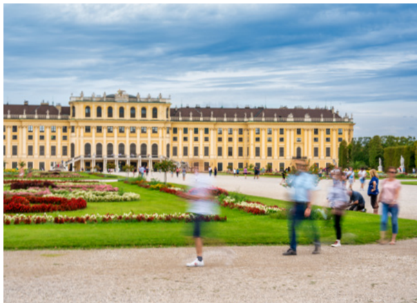
SCHÖNBRUNN PALACE, VIENNA

After breakfast, disembark the Riverside Mozart and enjoy complimentary transfers to the airport, train station, or central hotel.