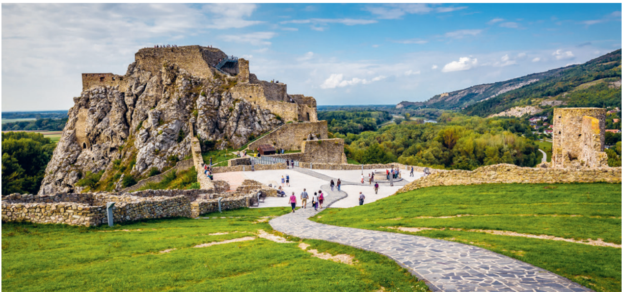
DEVÍN CASTLE NEAR BRATISLAVA

Arrive today in the 2,000-year-old Lower Austrian town of Tulln. Settled in pre-Roman times, hear about centuries marked by Turkish invasions, floods, and the Thirty Years War, and see the Nibelungen Fountain commemorating Attila the Hun's proposal to Kriemhild (which legend says took place in Tulln). Through RIVERSIDE CHOICE, you can take a fun bike tour through the Austrian countryside; discover one of