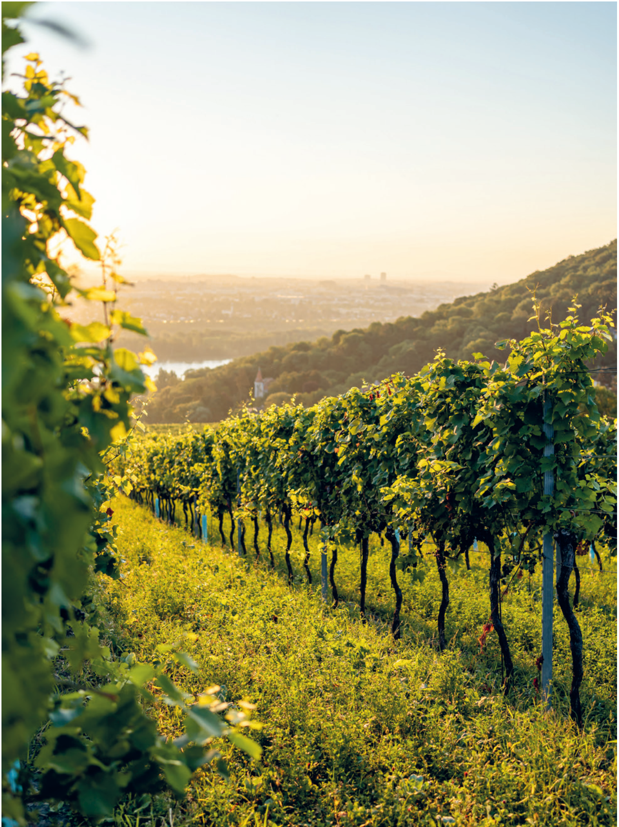
VINEYARD NEAR VIENNA