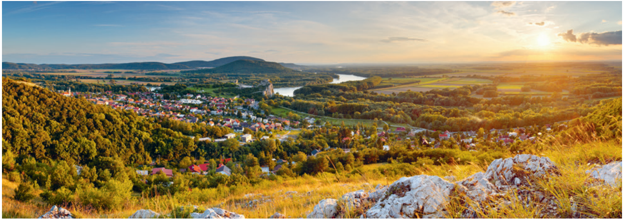
DEVÍN CASTLE NEAR BRATISLAVA

BUDAPEST TO BUDAPEST – 11 DAYS / 10 NIGHTS