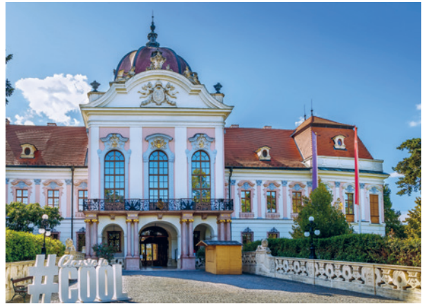
ROYAL PALACE OF GÖDÖLLŐ

Enjoy a leisurely morning – perfect for a relaxed breakfast, plenty of refills on your coffee or tea, and the chance to appreciate the passing scenery. After lunch, arrive in Bratislava, the enchanting capital of Slovakia, for a full menu of RIVERSIDE CHOICE options! How about time at the