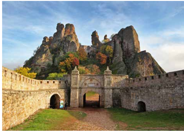
RUINS OF MEDIEVAL BELOGRADCHIK FORTRESS, BULGARIA

in 3500 BC. Learn about the many cultures that contributed to the creation of Vidin over the centuries, including the Romans, Serbians, Hungarians, Ottomans, and Austrians. Highlights here include two well-preserved medieval fortresses; Orthodox churches, a synagogue, and a mosque; and a collection of Renaissance-era buildings. Don't miss our UNIQUELY RIVERSIDE visit to a Bulgarian home to learn about everyday life here and join a hands-on baking demonstration of local specialties. Spend the late afternoon and evening back on the ship, where a pampering massage may be the perfect way to wrap up an exciting day.