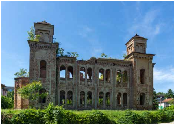
RUINS OF THE VIDIN SYNAGOGUE

This morning you'll find yourself in one of the Lower Danube's southernmost sections. Step off the ship in the Bulgarian port city of Vidin. This fertile hinterland is known for its wine production, which dates back to the time of the Thracians