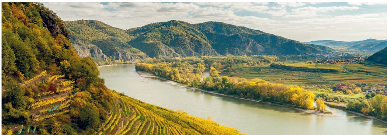
WACHAU VALLEY NEAR DÜRNSTEIN

Not all weeks are created equal, but this is one you'll be talking about for years to come! Your 8-day voyage begins in Passau, where the Danube, Inn, and Ilz Rivers converge. Then, on to Linz, birthplace of the world's first cake; quaint Grein, home to Austria's oldest theater; and lovely Dürnstein, which remains forever connected to England's King Richard the Lionheart and his faithful minstrel, Blondel. Spend two unforgettable days in Vienna, where the opulent palaces and Baroque architecture simply invite you to waltz! Afterward, discover the spirit of Hungary, with port stops in Esztergom, one of the country's oldest towns, and, of course, Budapest, the exquisite capital spanning both banks of the Danube.