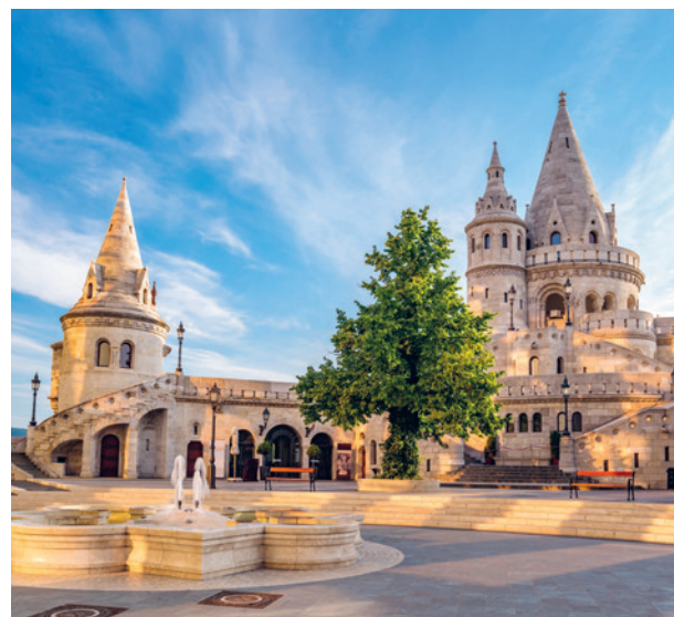
FISHERMEN'S BASTION, BUDAPEST

After breakfast, disembark the Riverside Mozart and enjoy complimentary transfers to the airport, train station, or central hotel.