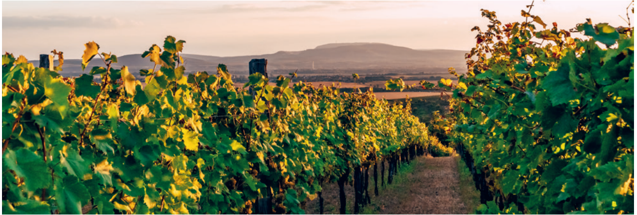
VINEYARDS AT SUNSET

Three regal Habsburg capitals, the incomparable Wachau Valley, and a rollout of the harvest's new wines – it all equals one amazing Danube cruise! Spend a full week exploring, starting in Austria's capital, Vienna, the divine City of Music. Then, investigate the treasures of Melk's Benedictine abbey, and wander through Krems, where wine connoisseurs congregate each autumn. The terraced vineyards and apricot orchards of the glorious Wachau usher you on to the unexpected gem of Bratislava, Slovakia, and Hungary's Visegrád, Esztergom, and Budapest, one of the world's most elegant cities. But beyond sightseeing, you'll also help the locals celebrate the year's grape harvest during St. Martin's festivities, where the new wine is blessed and served for the very first time!