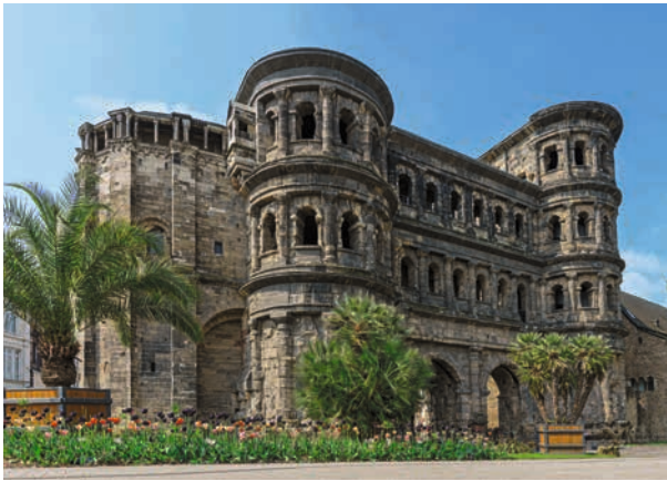
PORTA NIGRA, TRIER