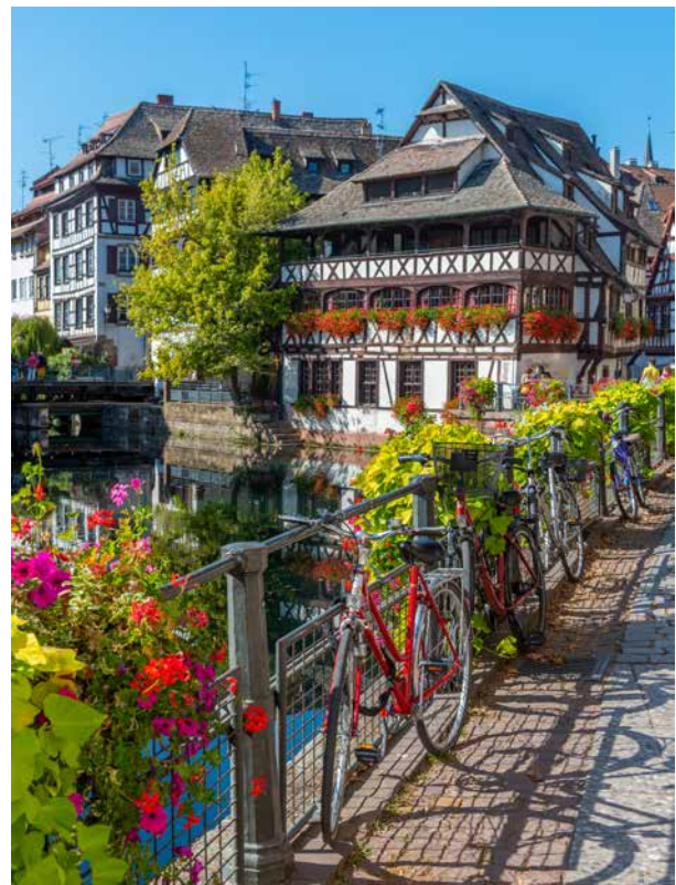
LA PETITE FRANCE, STRASBOURG

A big "bonjour" as you arrive in the unforgettable French city of Strasbourg. Plenty of RIVERSIDE CHOICE excursions are on offer today, including a guided tour of the city and its beautiful cathedral, a panoramic tour with included canal cruise, a guided bike tour, or a trip to the unspoiled medieval village of Obernai!