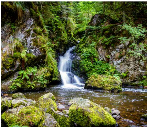
RAVENNA GORGE, BLACK FOREST