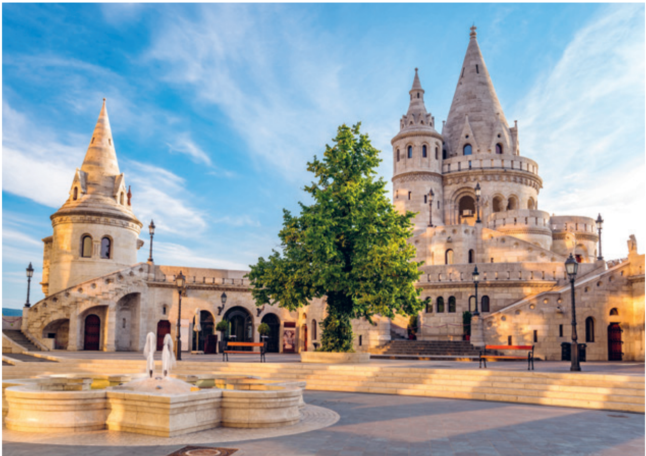
FISHERMEN'S BASTION, BUDAPEST