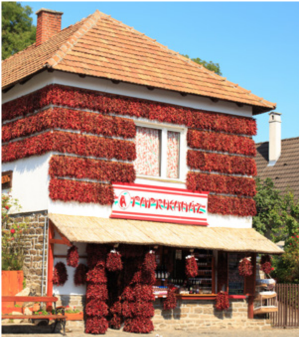
PAPRIKA HOUSE, VUKOVAR