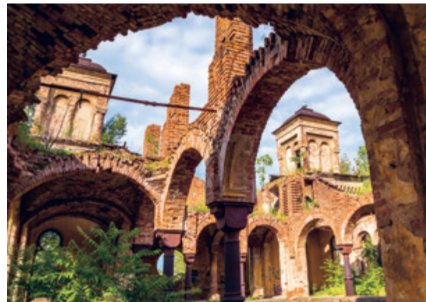
RUINS OF VIDIN SYNAGOGUE

After breakfast, your ship makes its grand arrival into Budapest, Hungary's amazing capital spanning both banks of the Danube. Disembark and see the highlights by comfortable coach; visit Austrian Empress Sisi's beloved Gödöllő Palace, or join an outing to Szentendre, a historic town