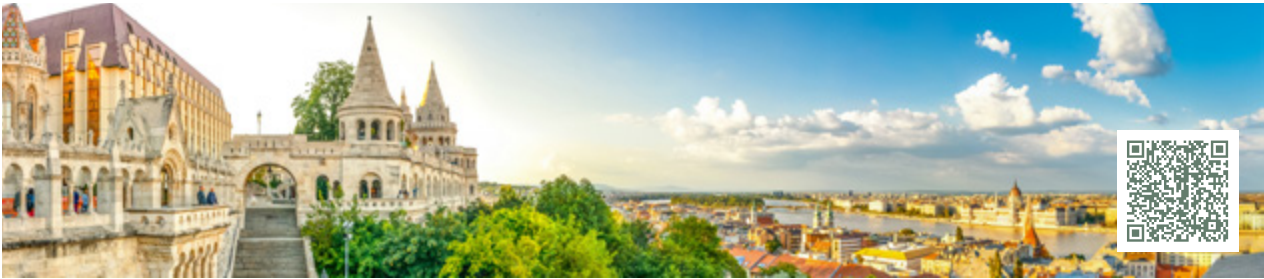
FISHERMEN'S BASTION, BUDAPEST

BUCHAREST TO NUREMBERG – 16 DAYS / 15 NIGHTS