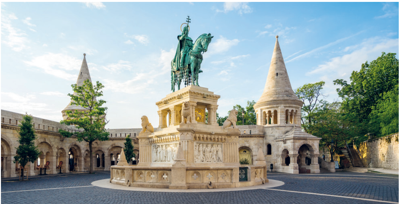
ST. STEPHEN'S MONUMENT AND THE FISHERMEN'S BASTION, BUDAPEST

After breakfast, disembark the Riverside Mozart and enjoy complimentary transfers to the airport, train station, or central hotel.