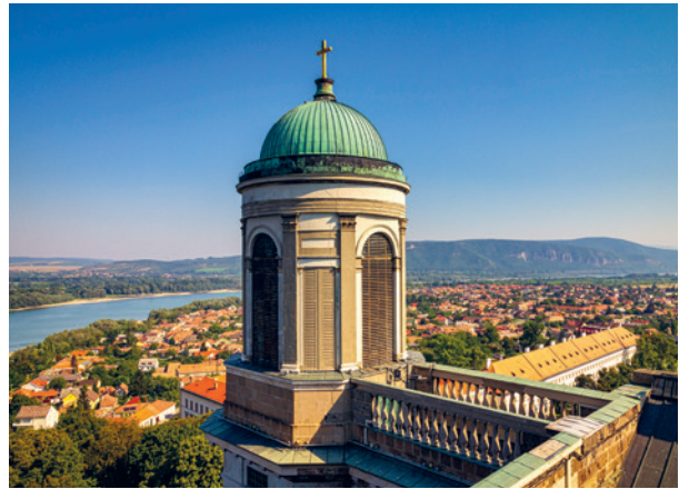
VIEW OF THE DANUBE FROM ESZTERGOM BASILICA

As you enjoy a hot, fresh cup of coffee or tea up on the Vista Deck this morning, you'll be impressed by your ship's grand entrance into Budapest – like something out of a movie! A fantastic day awaits and with RIVERSIDE CHOICE, you can see the highlights by comfortable coach; visit the monumental Parliament