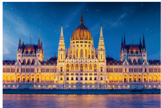
PARLIAMENT BUILDING, BUDAPEST

After breakfast, disembark the Riverside Mozart and enjoy complimentary transfers to the airport, train station, or central hotel.