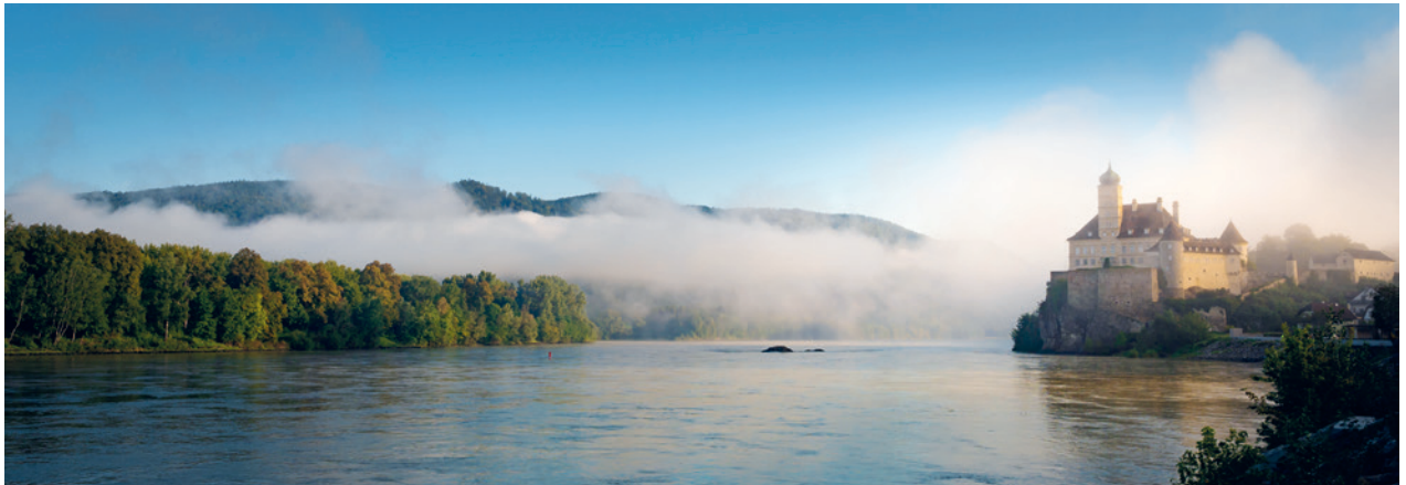
WACHAU VALLEY CASTLE

From Austria to Hungary, there's so much to see and experience along the remarkable Danube! Step aboard your luxury cruise ship in Vienna, one of the river's four inviting capitals. Then, cruise into the lovely Wachau Valley, a wonderland of apricot orchards, vineyards, castles, and charming ports, including Linz, birthplace of the world's first cake; Melk with its 11th-century Benedictine abbey; charming Dürnstein – forever tied to its imprisonment of King Richard the Lionheart; and more. Then, pass into Hungary and visit Esztergom, where priceless treasures await at the country's largest church on Castle Hill – or you might enjoy hiking or biking to see the sights. Finally, raise a glass of Tokaji aszú (Hungarian wine) and toast the beauty of Budapest as you enter the capital in style, surrounded by icons on both banks of the Danube.