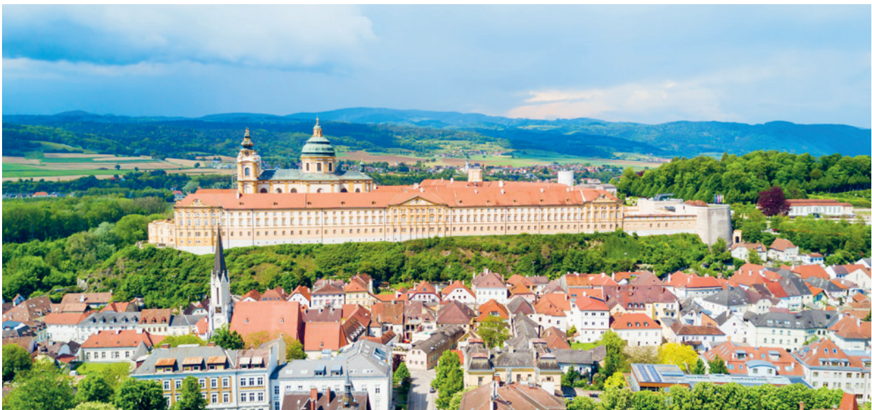
BENEDICTINE ABBEY, MELK

After breakfast, disembark the Riverside Mozart and enjoy complimentary transfers to the airport, train station, or central hotel.