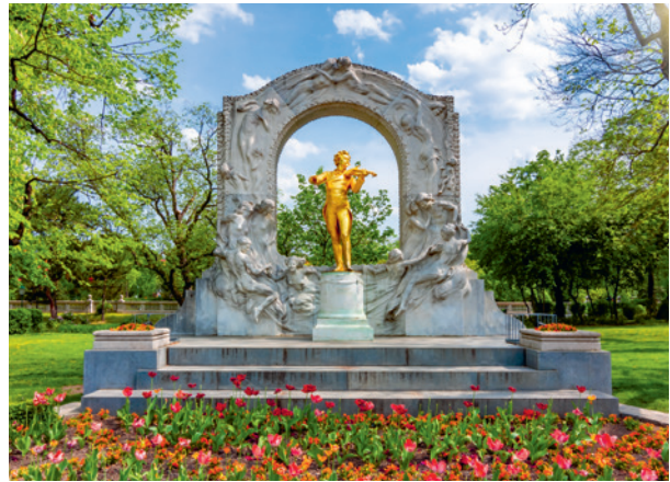
JOHANN STRAUSS MONUMENT, VIENNA

Early risers this morning will appreciate the breathtaking scenery of the Wachau Valley as your ship makes its way to the next port. After breakfast, arrive in Dürnstein, where an expert guide will regale you with tales about King Richard the Lionheart's imprisonment here.