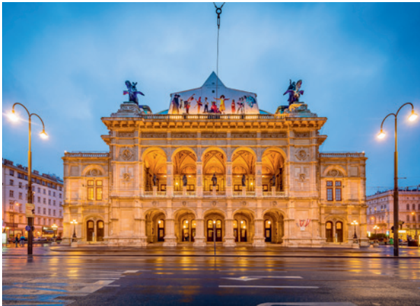
STATE OPERA, VIENNA

Early risers this morning will appreciate the breathtaking scenery of the Wachau Valley as your ship makes its way to the next port. After breakfast, arrive in Dürnstein, where an expert guide will regale you with tales about King Richard the Lionheart's imprisonment here. RIVERSIDE CHOICE options include a brisk hike up to the town's clifftop castle ruin for great views over the Wachau Valley; a visit to an Austrian vinothèque for a tasting of the Wachau's popular wines; and a guided visit along the celebrat-