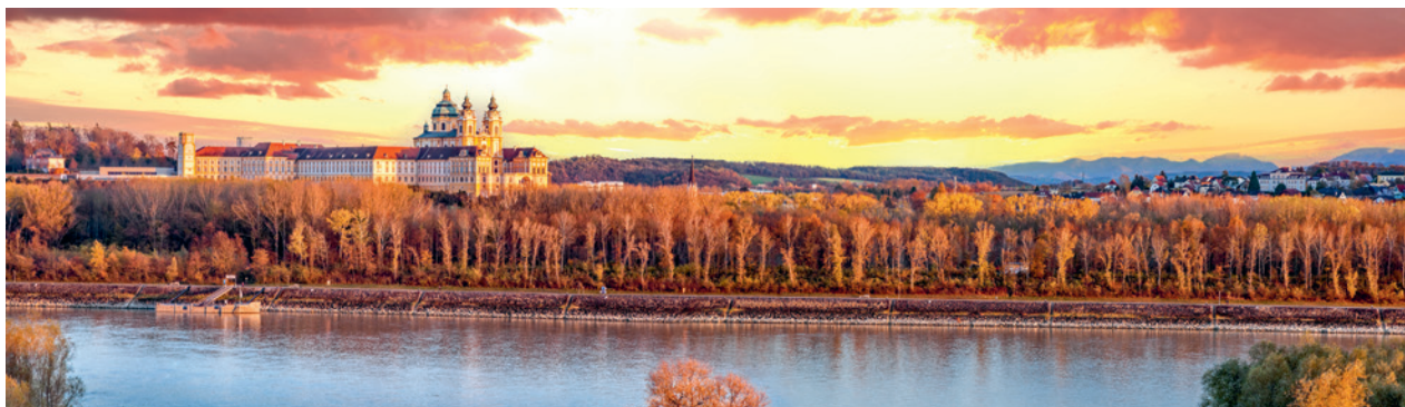
MELK AT SUNRISE

This remarkable week-long adventure features Vienna and Budapest, two of the most celebrated darlings of the Danube! Vienna puts its best foot forward with a grand welcome to the much-adored City of Music. Then, you're off and cruising in pampered luxury, passing through the world-famous Wachau Valley to see its castles, terraced vineyards, and orchards – you won't want to miss sampling some of Europe's most delectable wines and apricot treats! In Melk, explore the library of ancient manuscripts in the 11th-century Benedictine abbey, and visit tiny (but impressive) Dürnstein, where Richard the Lionheart was imprisoned in 1192 as he returned home from the Crusades. Return to Vienna for more time in the exquisite capital before crossing into Hungary. As your ship glides into Budapest, raise a glass of Tokaji aszú (Hungarian wine) and toast the city's legendary beauty and many highlights on both sides of the Danube.