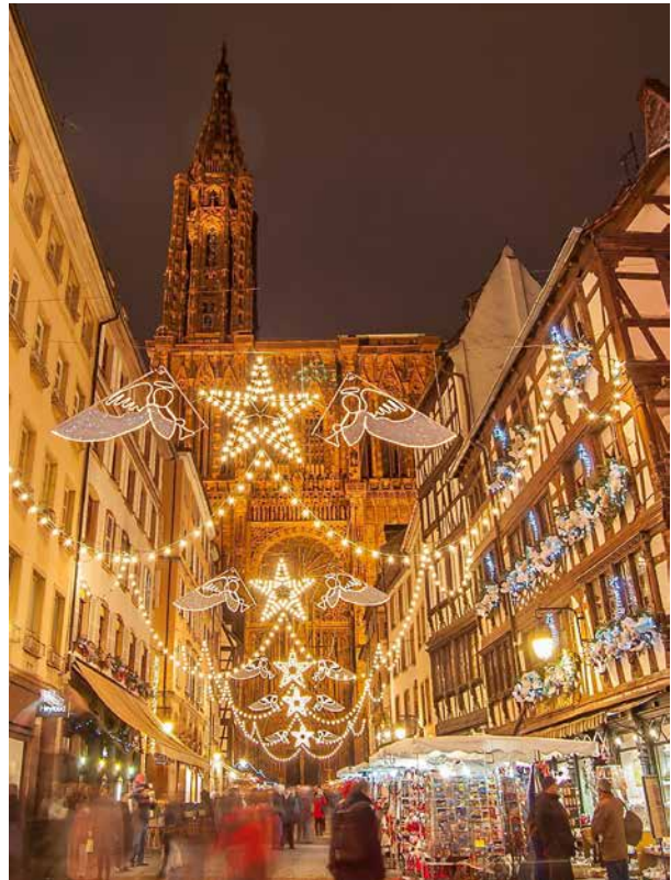
CHRISTMAS DECORATIONS IN STRASBOURG

Fröhliche Weihnachten – Merry Christmas! Arrive early in 2,000-year-old Speyer, one of Germany's oldest cities. With RIVERSIDE CHOICE, visit the Speyer Technology Museum to browse its fascinating land, air, water, and space exhibits, or join a guided walk through the Old Town to see the highlights. Then, head back to the ship for a tasting of various Glühwein varieties and freshly made German Brezeln (pretzels). After a festive onboard lunch, arrive in Mannheim, where the Rhine and Neckar Rivers meet. Learn about the unusual street layout and ties to many inventions throughout history, and enjoy a bird's-eye