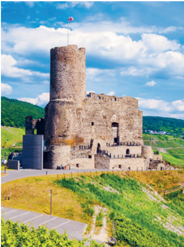
LANDSHUT CASTLE, BERNKASTEL

A big "bonjour" as you arrive in the unforgettable French city of Strasbourg. Plenty of possibilities are on offer here, like a guided tour of the city and its beautiful cathedral; or a trip to medieval Obernai for an Alsatian wine tasting.